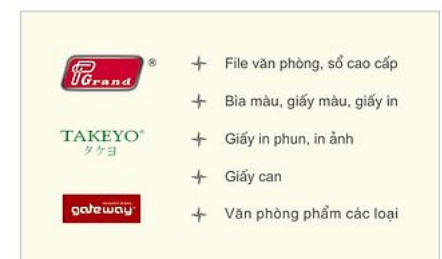
Front and back side of a business card in Vietnam, 2008